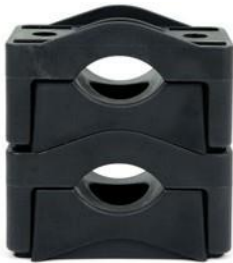
SEG Type 26 - 50