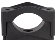
SEG Type 80 - 110