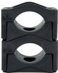
SEG Type 50 - 80