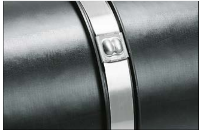
Protective channel LFPC, polyolefin, black.

The fire protection properties of the material relate to the test performed on defined test samples. This is a test under laboratory conditions and not directly transferable to the product made from this material.