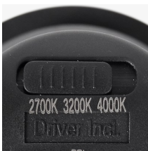
Adjustable temperature switch