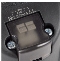
Easy wiring with push-fit connector