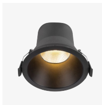
Triac driver integrated in the body