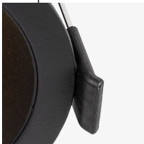
Clips with protection