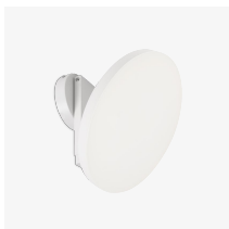
Tilttable wall/ceiling bracket Ref. 1.2030.8102