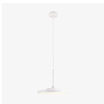
Suspension kit 1,5m. Ref. 1.2030.8101