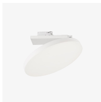
Tilttable 3 phases track adapter Ref. 1.2030.8103