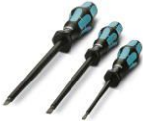
Screwdriver range, consisting of the three small screwdrivers: SZS 1.0 x 4.0, SZS 1.0 x 6.5, SZG 0.9 x 6.5

Please be informed that the data shown in this PDF Document is generated from our Online Catalog. Please find the complete data in the user's documentation. Our General Terms of Use for Downloads are valid ( http://phoenixcontact.com/download )