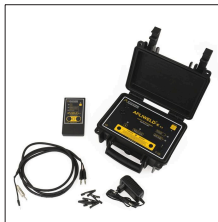
AT-100N Kit Apliweld-E: Ignition kit