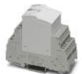
Plug-in device protection, according to type 3/class III, for 3-phase power supply networks with separate N and PE (5-conductor system: L1, L2, L3, N, PE), with integrated surge-proof fuse and remote indication contact.

Type 3 surge protection device - PLT-SEC-T3-3S-230-FM - 2905230