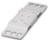
Universal wall adapter for securely mounting the device in the event of strong vibrations. The device is screwed directly onto the mounting surface. The universal wall adapter is attached on the top/bottom.

Assembly adapters - UWA 182/52 - 2938235