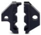
Spare die for CRIMPFOX-TC 10

Replacement die - CRIMPFOX-TC 10/DIE - 1212296