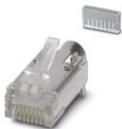
RJ45 pin insert, CAT5e, 8-pos., shielded, IDC connection method, for litz wires AWG 27 ... 26, with strain relief

Please be informed that the data shown in this PDF Document is generated from our Online Catalog. Please find the complete data in the user's documentation. Our General Terms of Use for Downloads are valid ( http://phoenixcontact.com/download )